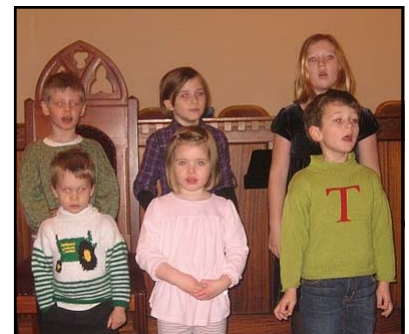
Children's Choir Performing